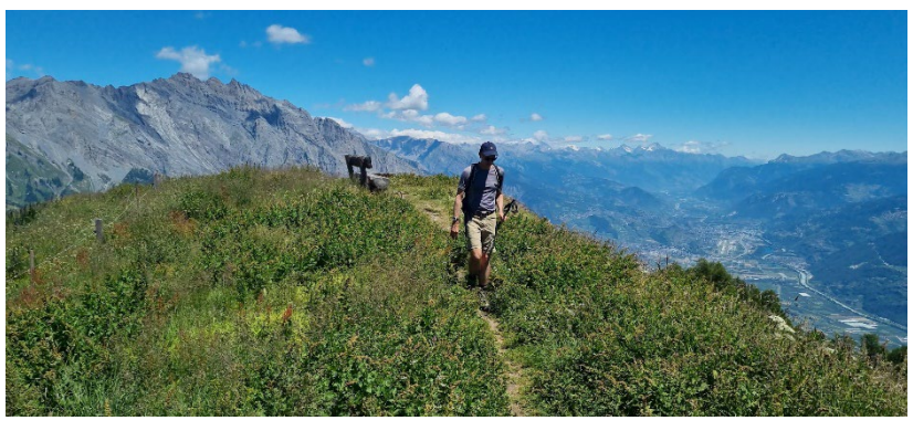
8.97 km Longueur Mont. / Desc. 1'043 m/447 m Alt. min/max 1'344 m/2'188 m A pied en été ▼ 3 h 58 min 2'400 2'200 2'000 1'800 1'600 1'400 1'200 1'000 0.0 km 9.0 km

From Ovronnaz (1340) we walk on a gentle trail through trees to Quieu (1941) from where we have spectacular 360° views of snow-covered peaks especially Grand Combin and the Weisshorn. We continue to La Grand-Garde (2146) and La Seya (2182) with even better views, then to the chairlift at Jorasse (1947). There are no vertiginous passages. Download trail | Photo album